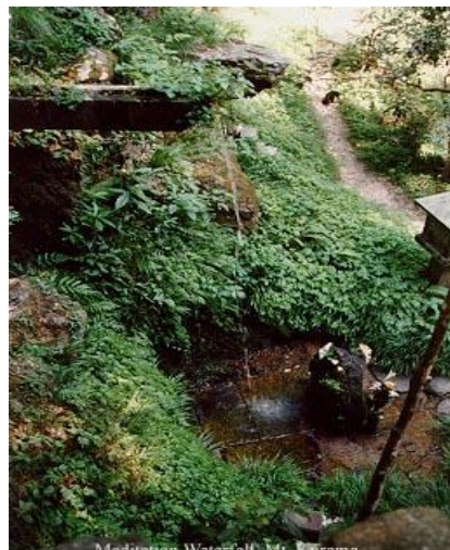
Meditation Waterfall, Mt. Kurama

And so in March 1922, Usui went about fasting and meditating, placing 21 stones before him on the ground. The Temple and the mountain itself is the Spiritual symbol of Kurama Temple. Steps lead down to a base where one can sit and meditate, and nearby there is a man made waterfall. One of the meditations involved sitting under the waterfall, allowing the stream to fall on his head. This is still practised today, the purpose is to open and purify the Crown Chakra. I personally believe he was under the water fall when he received enlightenment.